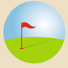
GOLF PUTTING GREENS