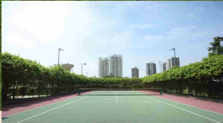
PARK ARIAL VIEW