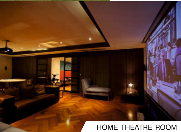
HOME THEATRE ROOM