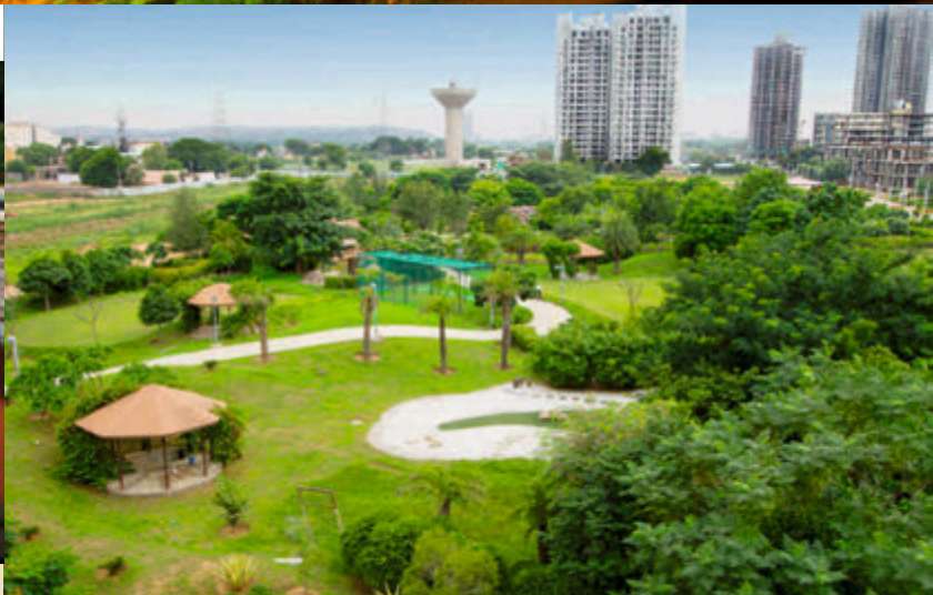
PARK ARIAL VIEW