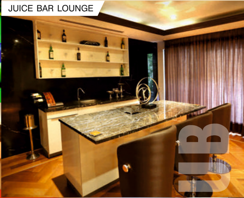
JUICE BAR LOUNGE