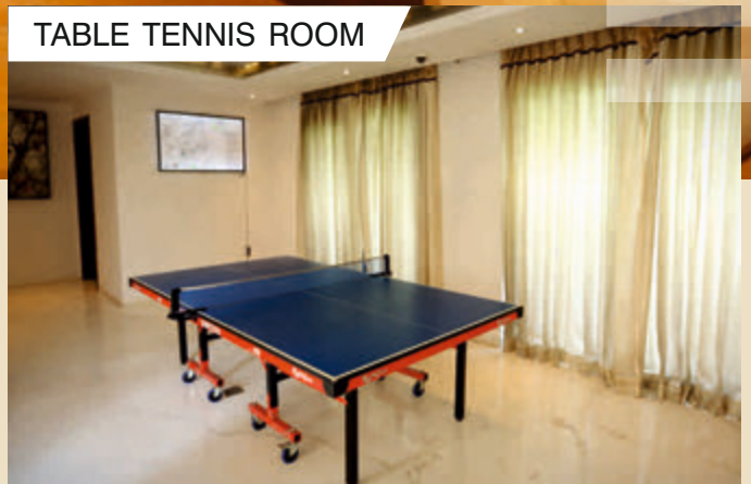
TABLE TENNIS ROOM